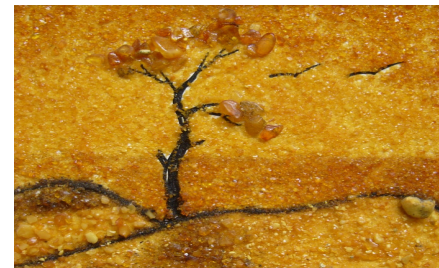
Museum Collection Amber Collage, made from the tiny grains of amber resin. 14cm x 11cm

Not sure if your item is of interest to us? Please call, we are happy to talk with you. PHTM can also digitally scan family documents you wish to offer us and return these to you promptly. Extreme care taken by museum staff. Thank you for your consideration.