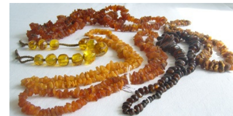
Museum Collection. Necklaces

Amber begins as a resin extruded from trees, millions of years ago. Its colour ranges from near white through to shades of yellow, brown, red and green. Amber is treasured and worn as jewellery by many Polish women.