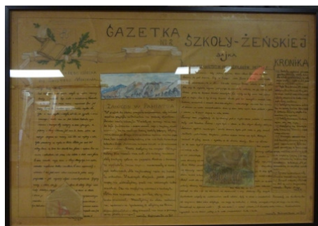
Museum Collection Gazetka No2 Szkoły-Zenskiej from Pahiatua Camp 130cm x 93cm

Wishing you all an early Merry Christmas and Happy New Year